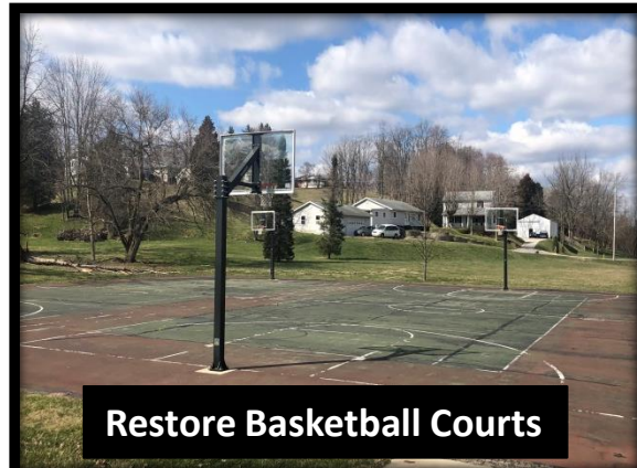
Restore Basketball Courts

Our basketball courts were constructed in the 80's and are almost unusable. They are in dire need of repair.