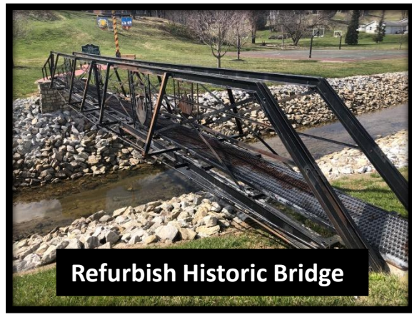
Refurbish Historic Bridge

Our 1900's era iron bridge leads the way to our Maypole, the center piece of our park. The bridge requires rust removal and painting to remain safe.